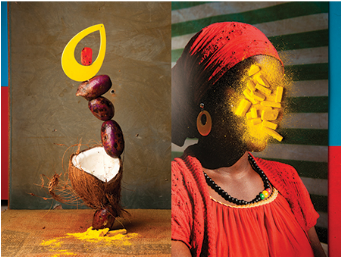
Lorenzo Vitturi, Yellow Chalk #1 , 2013, from the series 'Dalston Anatomy', archival pigment print mounted on aluminium with coloured wood subframe, 1 × 1.5 m.

gentrification. Vitturi attempts to preserve the spirit of the market and the neighbourhood by redefining the role of the traditional photographic documentarian. In making this series, Vitturi not only photographed on site in a traditional documentary manner, but also brought debris from the market into his nearby studio to create precarious and exotically imaginative sculptures and intricate collages, which he then re-photographed. Small towers of artificial flowers, hair extensions, potatoes, pig's trotters and powdery pigments are held together in a slapdash manner by long nails, strings and skewers; photographic portraits of market-goers are littered with, and obscured by, colourful dust and detritus that chimes with their outfits. Blatantly manhandled and multilayered, 'Dalston Anatomy' places the emphasis on its own making, but the content of these pictures also indicates a profound desire to commune with and communicate the world outside of the limits of photographic production. As Vitturi explained in a 2013 interview: 'These images [...] were not just simply the result of my secret imagination, but were, in fact, deeply connected with a wider reality.'