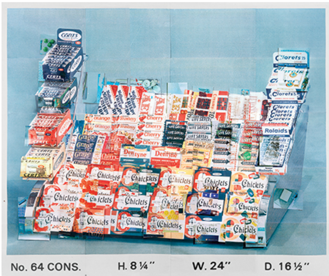
Sara Cwynar, Display Stand No. 64 H. 8 1/4" W. 24" D. 16 1/2", 2014, chromogenic print, 76 × 91 cm. Courtesy: the artist and Foxy Production, New York

Rather than addressing particular histories, Asger Carlsen's 'Hester' (2011–12) and Noémie Goudal's 'Observatoires' (Observatories, 2013–14) take on the familiar photographic tropes of the female nude and architectural typology, respectively. Both artists apply contemporary techniques to well-worn territories in a bid to reinvigorate them. Carlsen's deformed, excessively limbed and headless nude bodies – created entirely on screen but bearing the influence of artists such as Hans Bellmer – take full advantage of photography's digital flexibility and seamlessness. Carlsen's manipulation is so upfront and extreme that it's impossible to ignore – and yet the raw, physical presence of these figures is powerful enough to introduce an entirely new photographic perspective on the human form. Goudal also invents realistic yet fictional photographic constructions through the amalgamation of existing ones – in her case, by digitally aggregating fragments from images of concrete architecture found throughout Europe. She then reworks them into large-scale photographic backdrops that she re-photographs within barren landscapes or seascapes. The series reflects the influence of Bernd and Hilla Becher, yet catalogues a group of