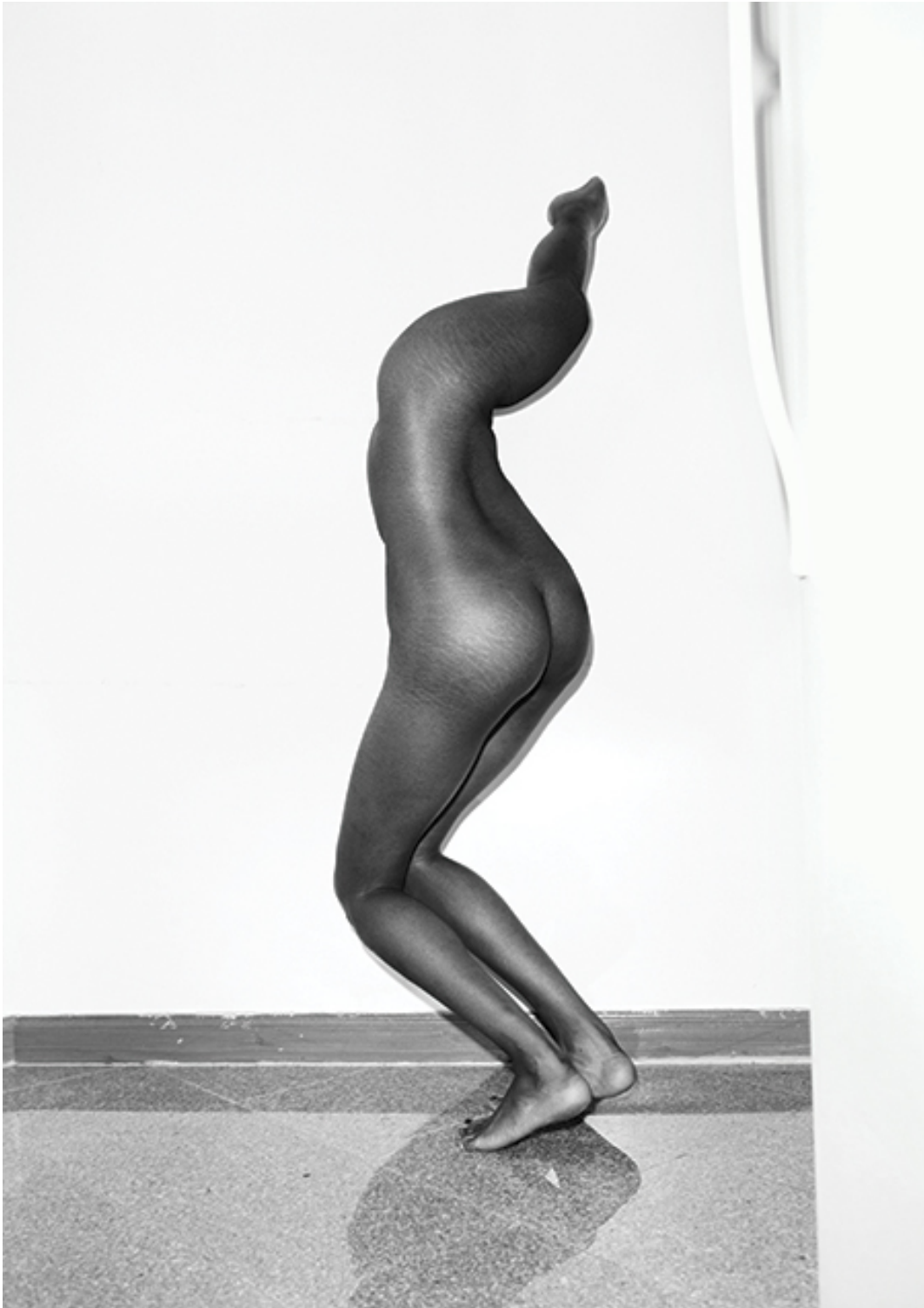
Asger Carlsen from the series 'Hester', 2012, pigment print, 50 × 70 cm.

imagined rather than real post-industrial architectural monuments, which nevertheless convey a sense of rigour, purposefulness and stature.