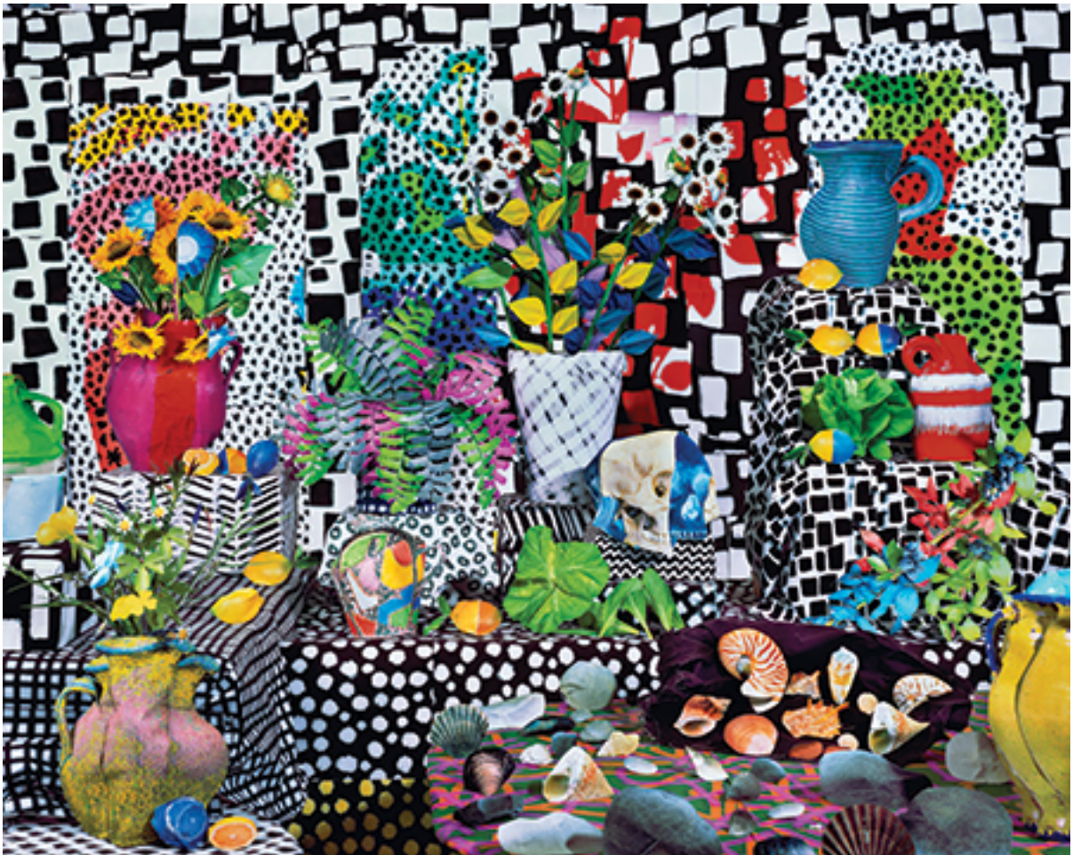
Daniel Gordon, Skull and Seashells , 2014, c-type print, 1.5 × 1.7 m.

(12) (2014), for example, is not simply an ostentatious gesture; it emphasizes the rough finish of the sun-drenched red stucco, concrete and chipboard seen within the image, and intensifies its glistening redness to almost blinding levels. Reminiscent of canonical works by figures such as Paul Strand and Minor White, 'Dingbats' is a concentrated meditation on how physical spaces can be creatively seen and lyrically constructed within the photographic frame – aspects amplified by the eccentric framing.