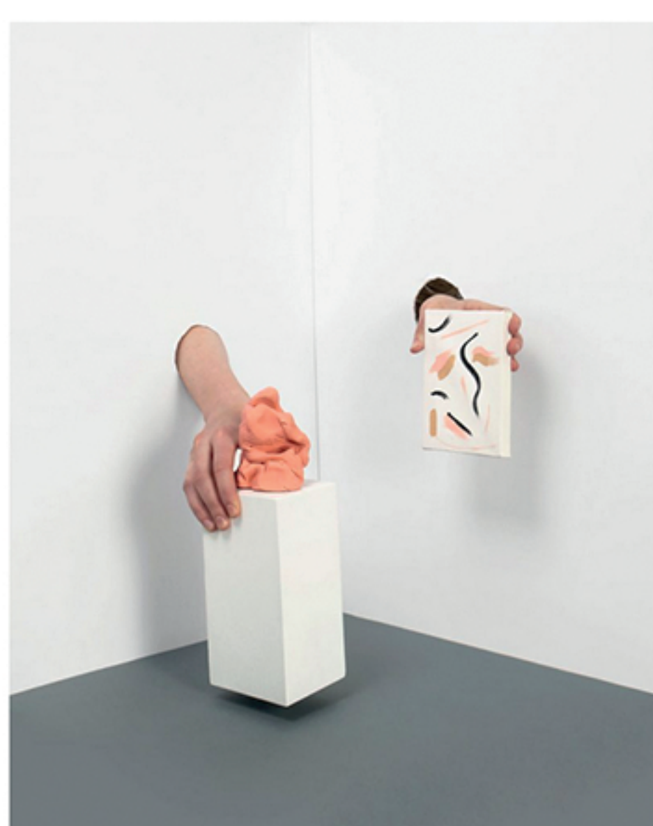
Rachel de Jooide - Triptych, 2017 (detail) c-print, mounted, wall print, custom framed