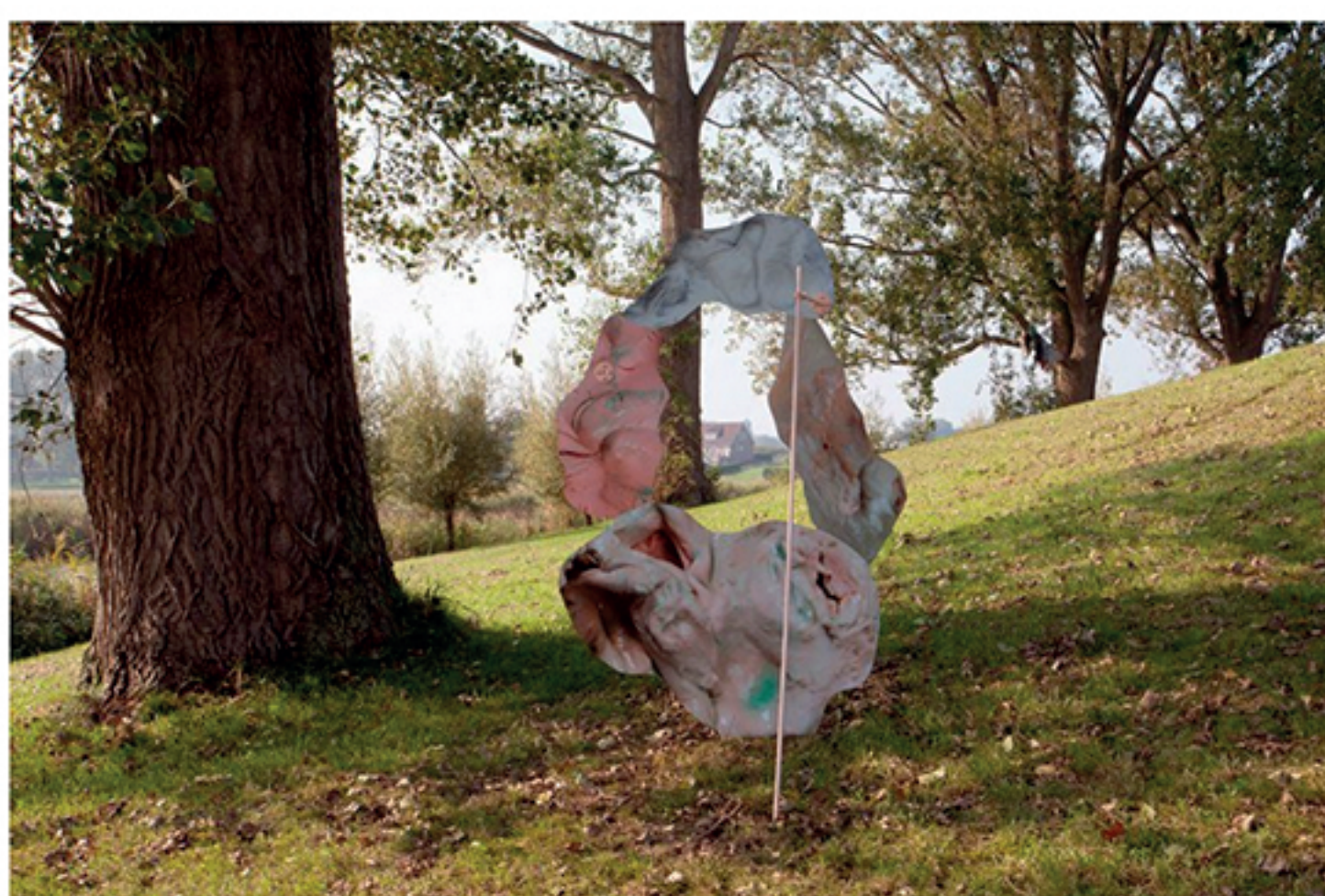
Rachel de Jooide - Stacked Sculpture In Nature I & II 2017 Inkjet print on dibond, powdered coated steel, 125 x 183 cm Collectie Kunstfort bij Vijfhuizen2017 @ Kunstfort bij Vijfhuizen, © Simon Trel

My work ranges from hybrid photographic sculptures to bronze works to sculptural ceramics. A central interest of mine is the play between the physical and the virtual world, exploring the relationship between the three dimensional object and its two dimensional representation.