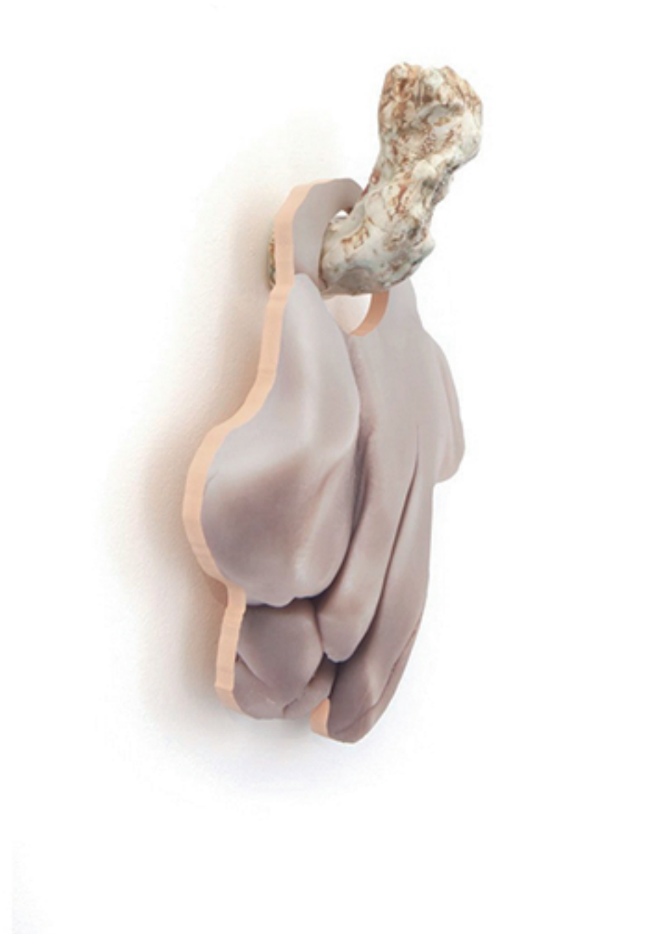
Rachel de Jooide - Soft Inquiry XI, 2015 Ceramic and archival Inkjet print on PVC 39.5 x 25.5 x 12 cm

I am currently writing a short movie about making an artwork. Several actors will play me and play themselves playing me. It will be a subversive short film, a doku-soap, a mockumentary with surreal elements. The point of focus is the thing art (commodity) in relationship to the artist (the body).