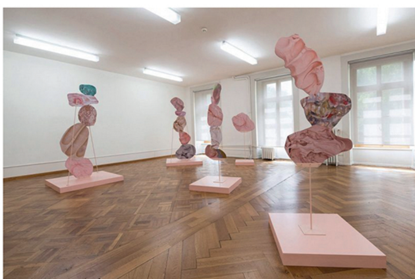
Rachel de Jooide - Installation view of Soft in the Centre @ Photoforum Pasquart, Biel/Bienne, Switzerland, 2017

My father's indestructibility and resilience and my grand father's resistance.